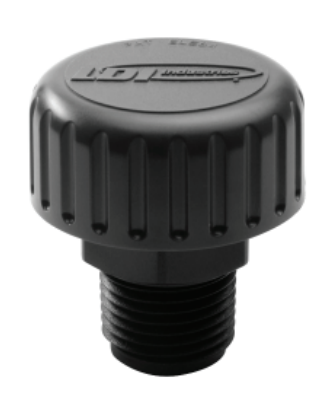
NOTE: All dimensions are inches