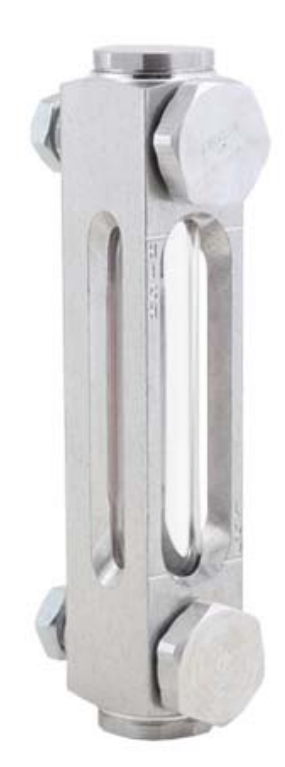
NOTE: All dimensions are inches [mm]