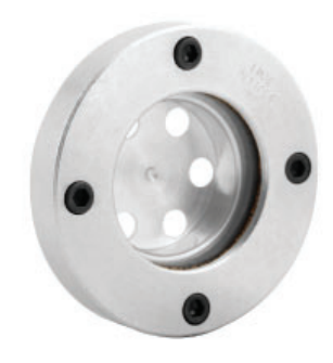
NOTE: All dimensions are inches [mm]