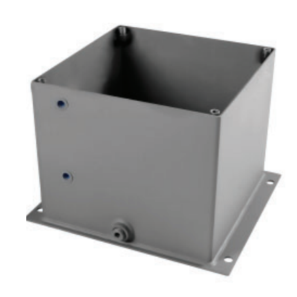
NOTE: All dimensions are inches