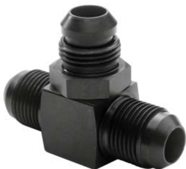
MAC3000 Series (inches)